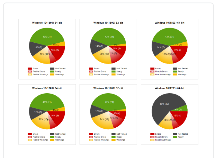
AdminStudio provides reporting for all supported versions of Windows 7, 8, 10 and Server

packages by status. Compatibility testing and reporting are provided for all supported versions of Windows 10 as well as Windows 7, 8 and Server.